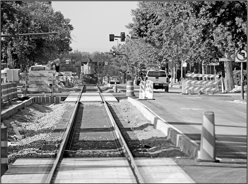
A northbound BNSF coal empty rolls along Mason Street in Ft. Collins, Colorado, in late August.

at the factory in Erie, Pennsylvania. This next-generation Evolution Series locomotive meets Tier 4 requirements that take effect in 2015 with the existing GEVO12 prime mover and without the need for urea-based after-treatment, a condition that the railroad industry has been seeking.