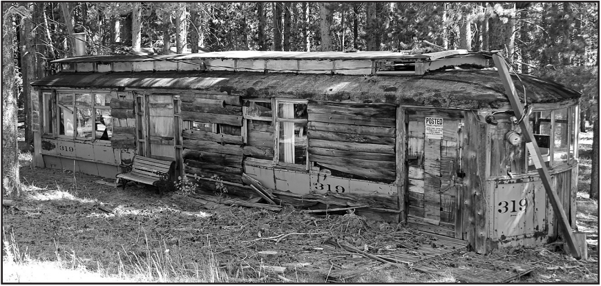
Former Denver streetcar 319 was still in the woods of Wyoming in late August.