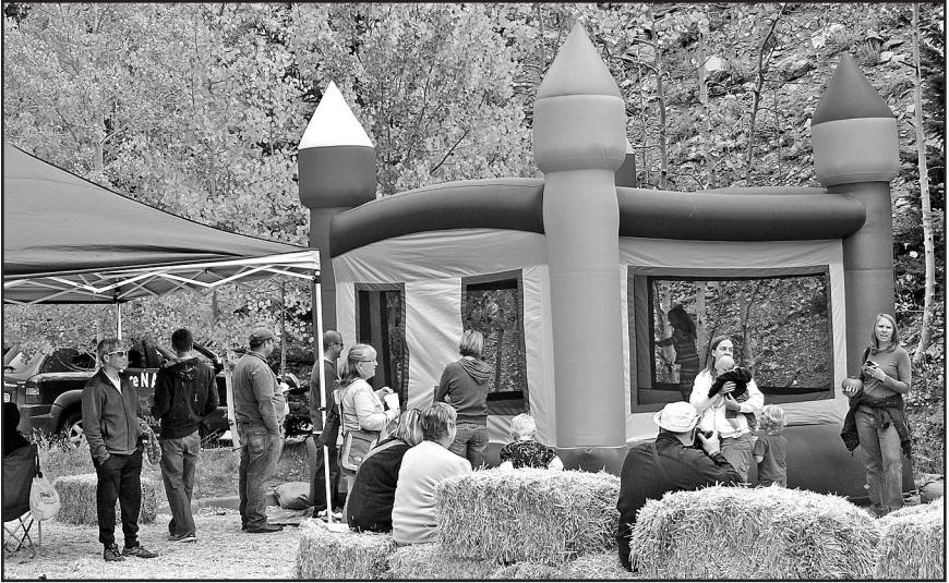
Georgetown Loop Railroad Oktoberfest activities.