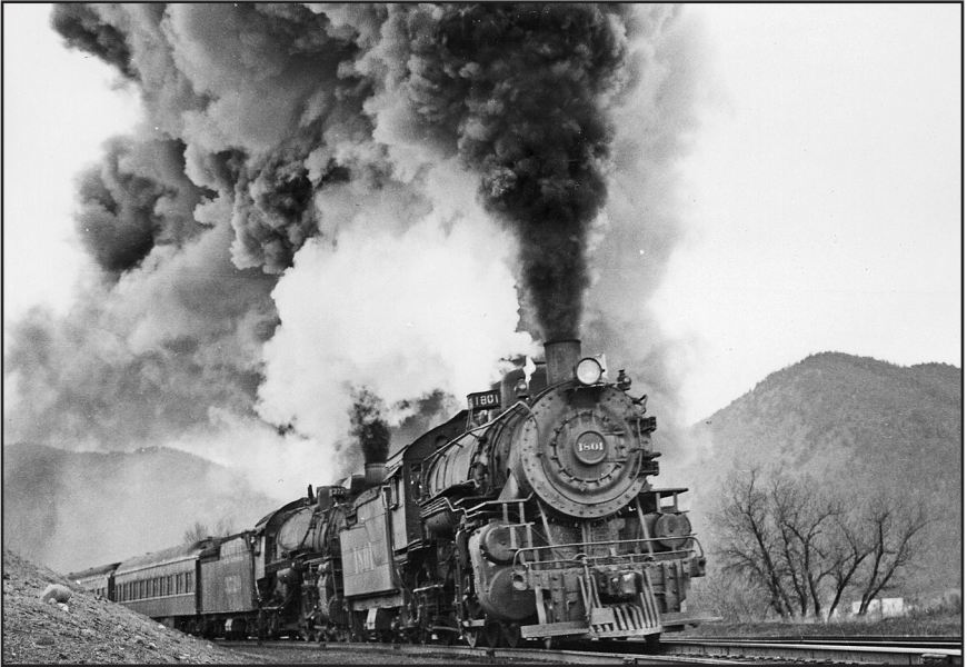
ATSF 1801 and 3720 are northbound as they crest the Palmer Divide at Palmer Lake, Colorado, on October 3, 1951.