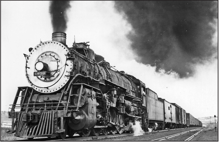
ATSF 3930 is southbound on the approach to Palmer Lake, Colorado, on October 3, 1951.