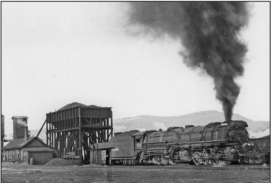
D&RG 3609 was photographed near the end of steam operations at Tabernash, Colorado, in August 1955.